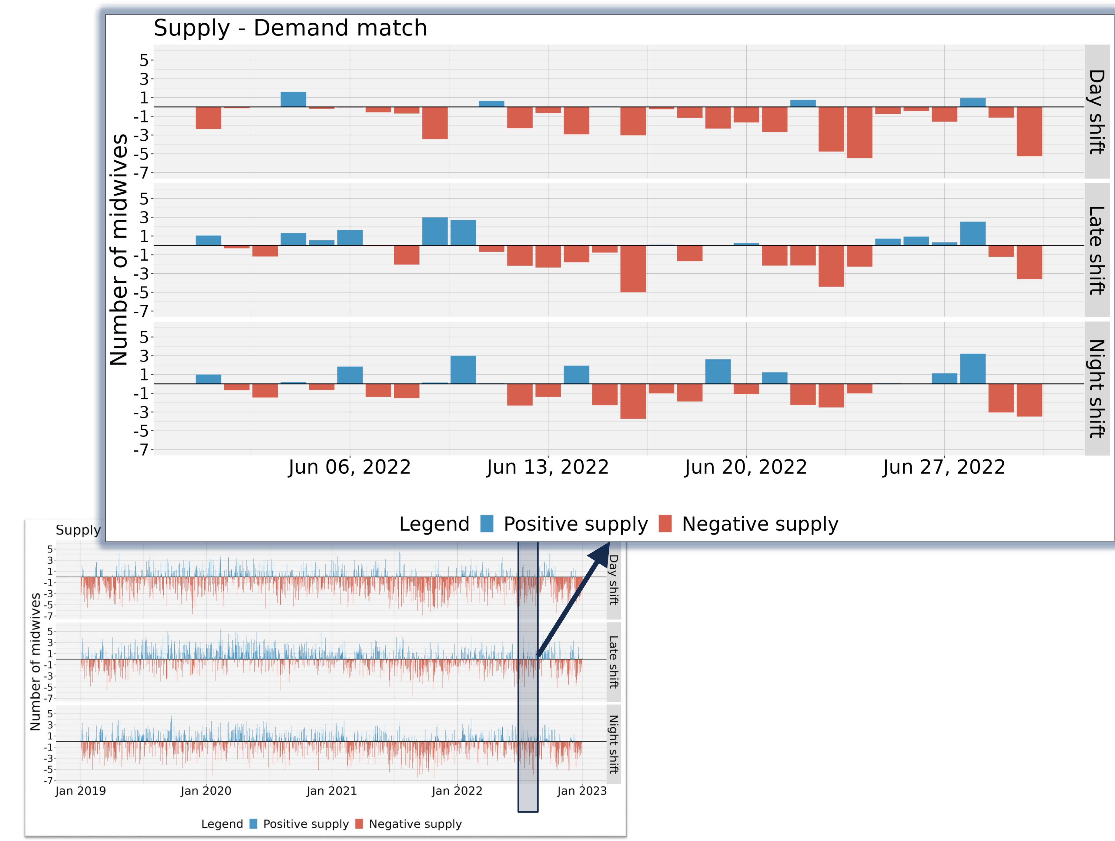
Figure 2. Supply-demand match on shift level for day, late and night shift. Full time frame and zoomed in time frame of one month. Number of midwives based on calculated hours of supply-demand match.